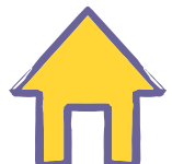
Homes & Support