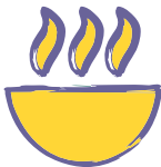
Healthcare & Nutrition